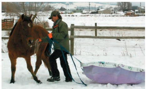
Leg-yield. Easy with pool prop

never mind giving you control of the feet. Good positive posture precedes athletic engagement.