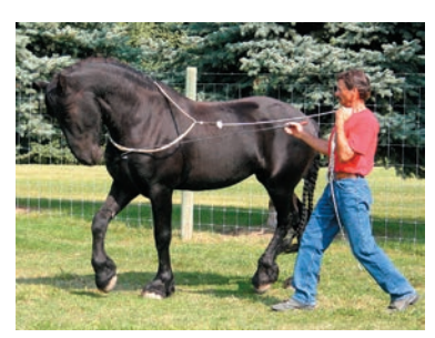
Round, Ljibbe on cordeo